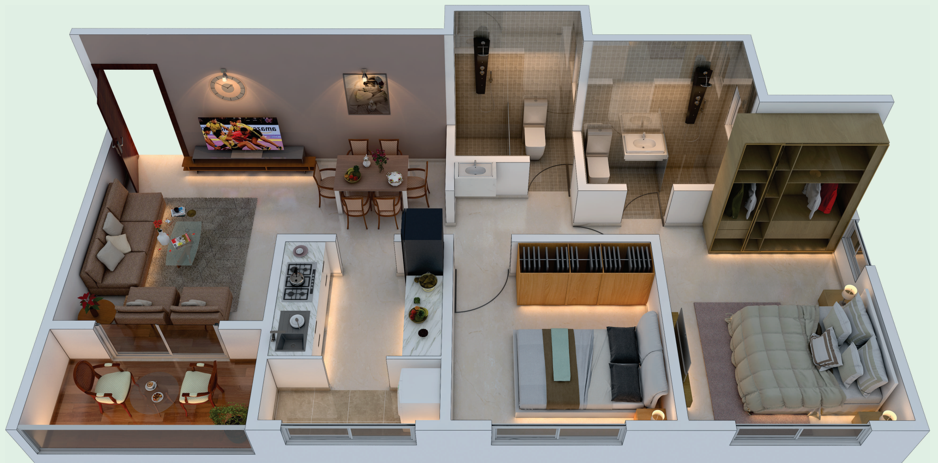
2 BHK Section View