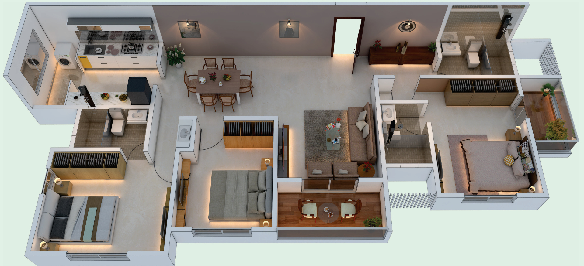
3 BHK Section View