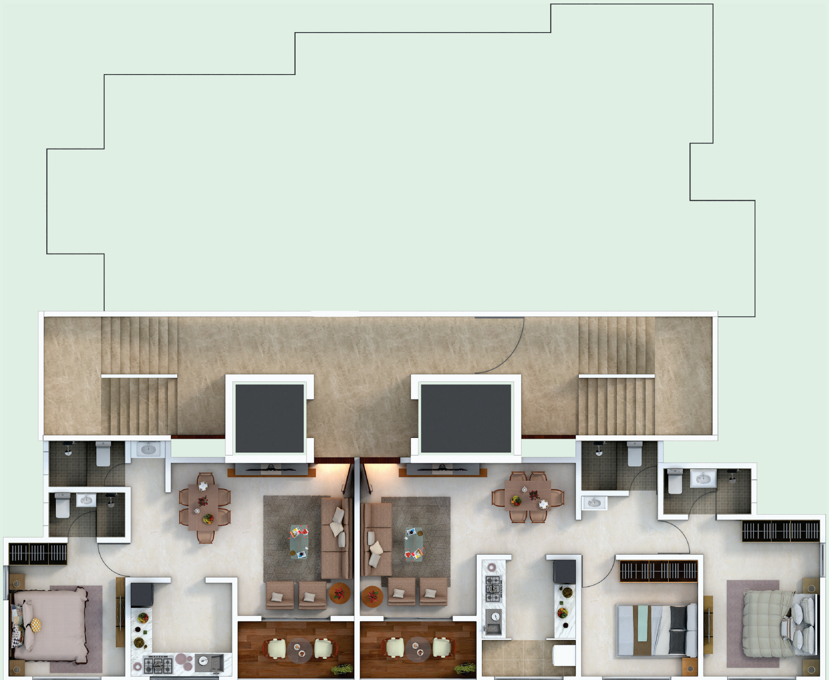
2nd to 4th Floor